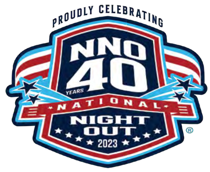
POLICE · COMMUNITY PARTNERSHIPS