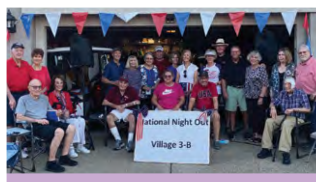
Village 3 B